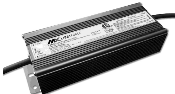
Dimensions (LxWxH): 200 x 70 x 46mm Net weight: 1.05Kg