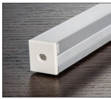
NTALB11 - FR