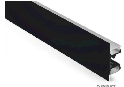
PC diffused cover