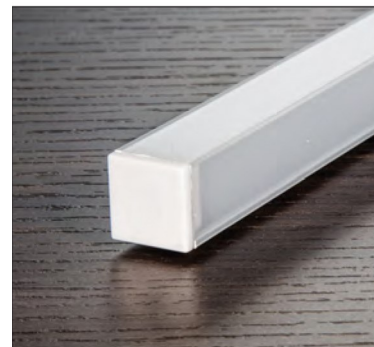
NTALB05 - FR