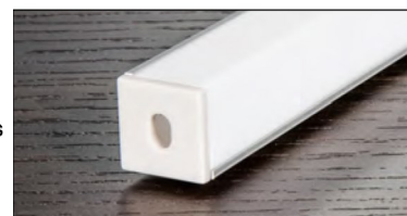
NTALB05 - OP