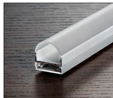
NTALB10 - FR