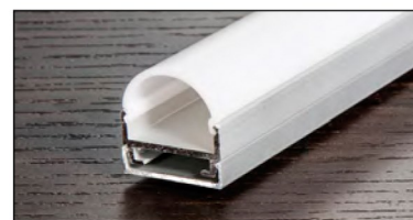
NTALB10 - OP